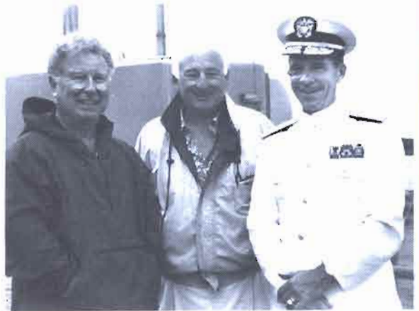
(From left) Business Development

This five mile, six knot sail hopefully won't be Constitution's last. There may be plans afoot for her to be part of a Tall Ships parade in New York Harbor in the year 2000 □