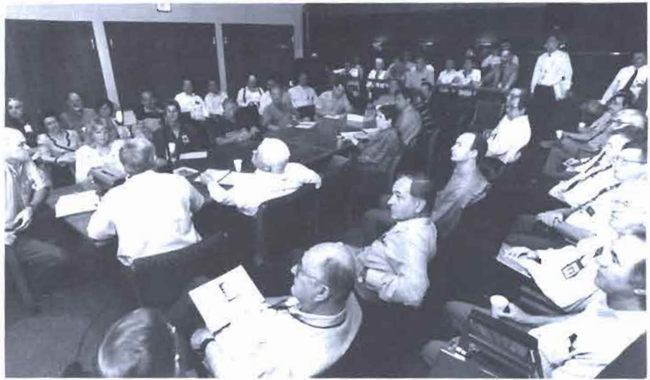
Proposal team members gather for the morning briefing on the KC4IS proposal.