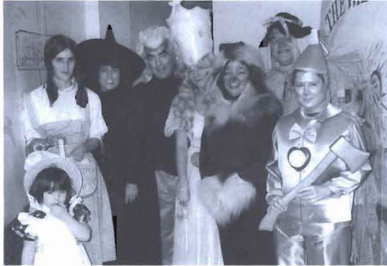
The 1998 Litton Wizard Of Oz cast.