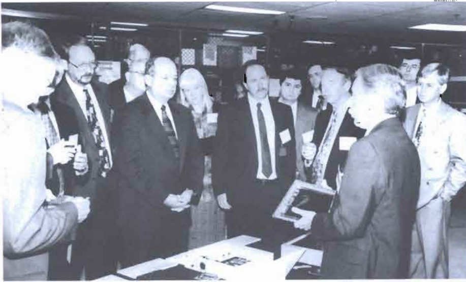
Key management members of CECOM and Litton viewed product demonstrations during their visit to DSD San Diego.