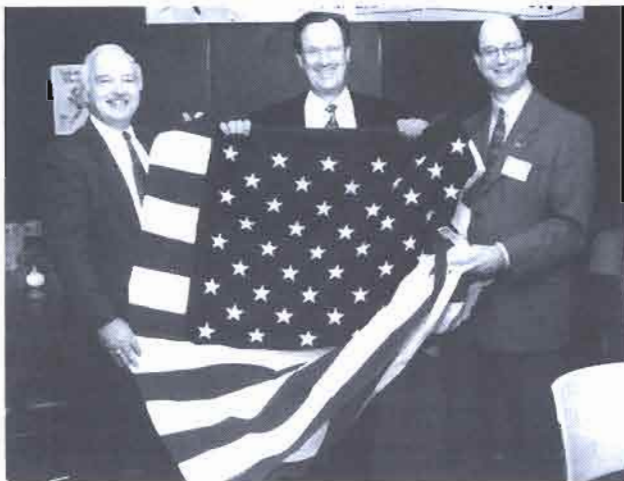
Congressman Brad Sherman (right)

Employees were invited to gather in the cafeteria in Building 1 to hear some brief remarks by the Congressman. He immediately disarmed the audience with his opening line. "Hello, I'm from the Federal Government and I'm here to help you." When the laughter subsided, the Congressman went on to speak about his entry into politics following careers as a CPA and an