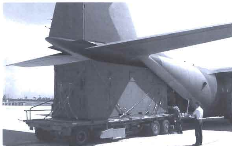
Looks like a tight squeeze, but it really will fit!