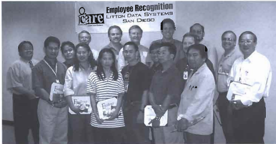
Pictured above are the latest ICARE winners from San Diego.