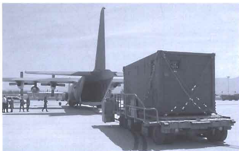
The OM is moved into position for loading on to the Italian Air Force C-130 at Pt. Magu NAS.